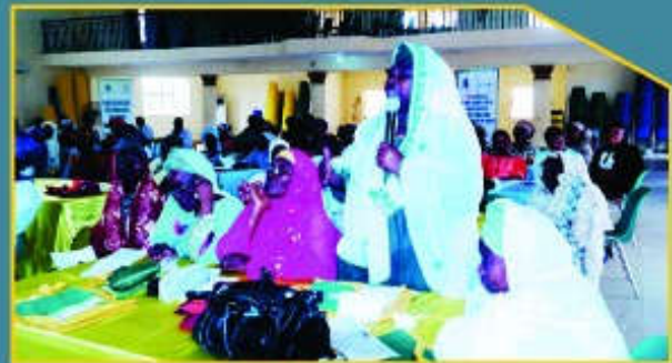
Grassroots Women Community Leaders strategising on how to support Women Politicians in Ekiti

More Inclusive Leadership Style: Women beneficiaries that have gotten into office are adopting a more inclusive leadership style.