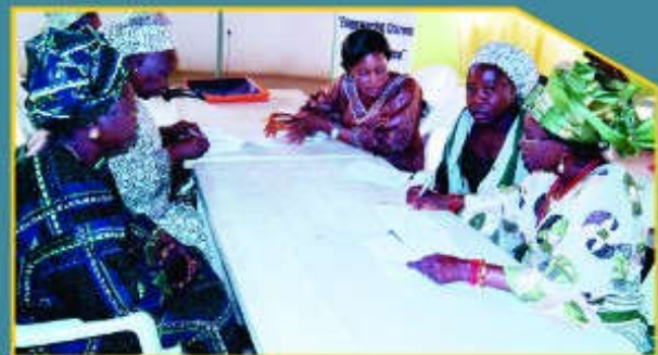
Grassroots Women Community Leaders being empowered to support Women Politicians in Osun