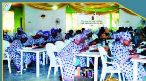
Female Politicians preparing their individual Campaign Budgets for the Election