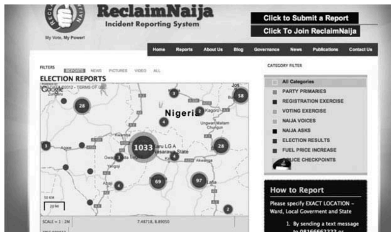
FIGURE 1. Screenshot of ReclaimNaija Ushahidi Crowdmap.